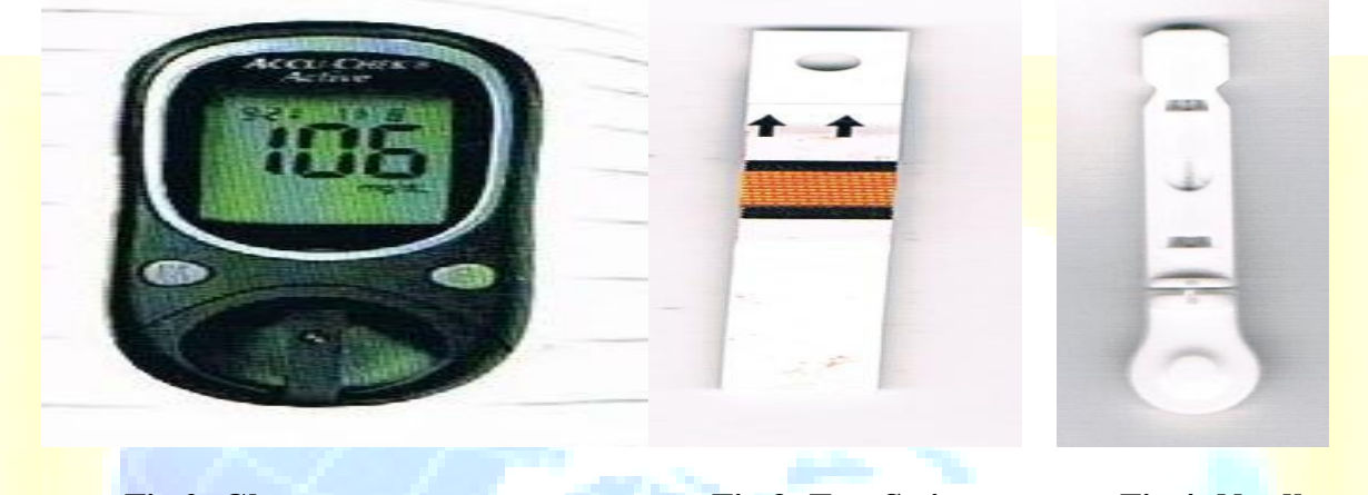
Fig 2: Glucometer

produced and the meter reads the level of glucose expressed in mg/dl or mmol/l. The glucometer is usually portable and is used at home for monitoring diabetic patients. A glucometer, and proper pharmaceutical treatment, is fundamental for a diabetic patient to maintain glycemic control at home.